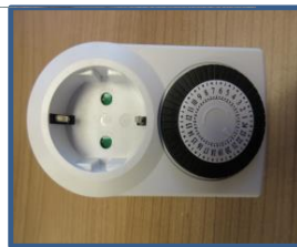
Foto del prodotto Picture of the item

L'oggetto descritto è conforme alla pertinente normativa di armonizzazione dell'Unione: