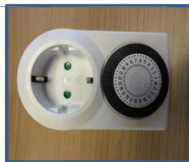
Foto článku Picture of the item

Uvedený cieľ je v súlade s príslušnými harmonizačnými právnymi predpismi Únie: The described object of the declaration is in conformity with the relevant Union harmonisation legislation: